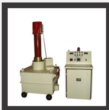
High Voltage AC Breakdown Tester