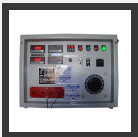
High Voltage AC Breakdown Tester