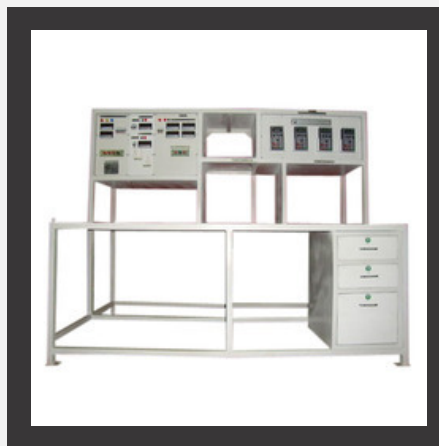
Pneumatic and Hydraulic Test Bench