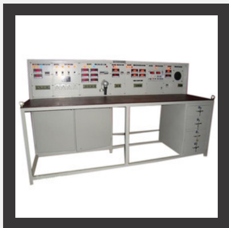
Universal Laboratory Test Bench