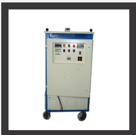
High Voltage Low Current Rectifier