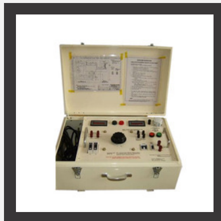
Knee Point Measuring Kit