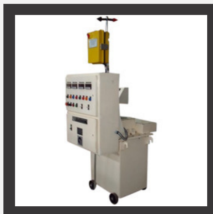
AC and DC Secondary Current Injection Source