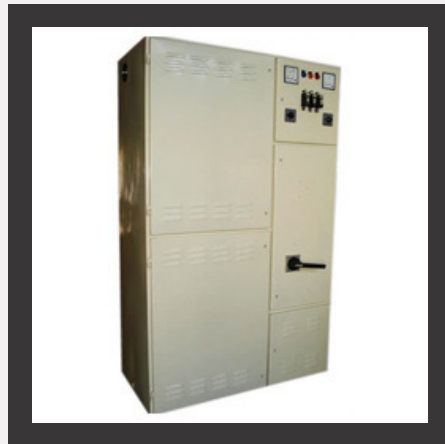
Power Factor Correction Panel