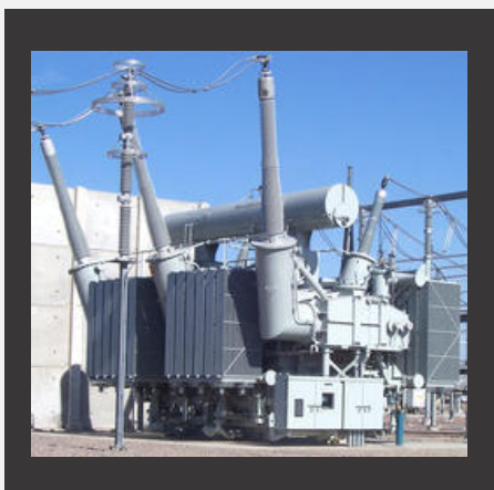
Power Testing Transformer