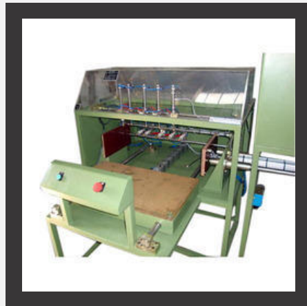
Capacitor Pack Testing Machine