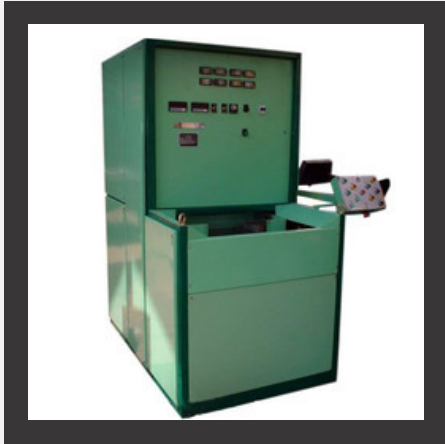
Dry Roll Press