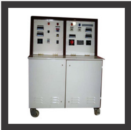
VCB Endurance Testing Machine