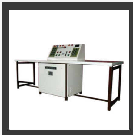
Transformer Test Bench