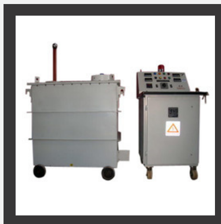
High Voltage DC Breakdown Tester