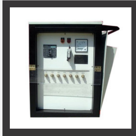
Single Phase Impedance Measurement Kit