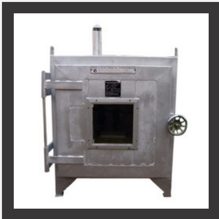
Industrial Drying Oven