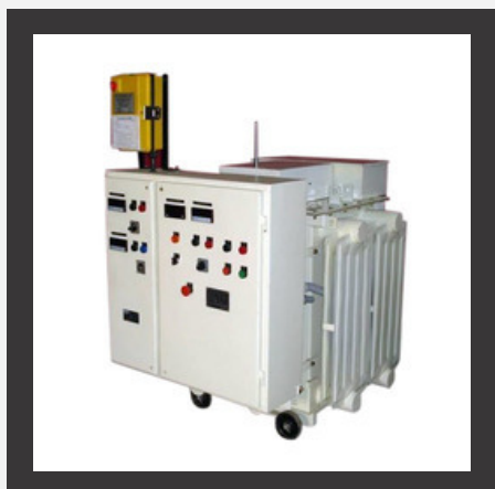
AC and DC Primary Current Injection Source