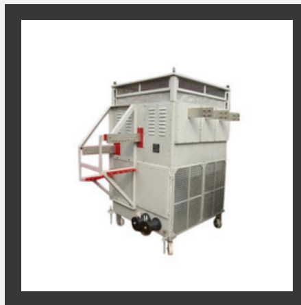
High Current Low Voltage Rectifier