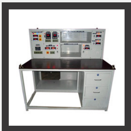
Electronics Test Bench