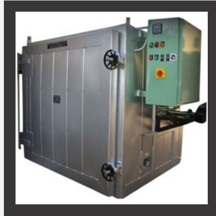
Industrial Baking Oven