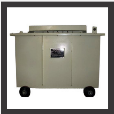
Booster Testing Transformer