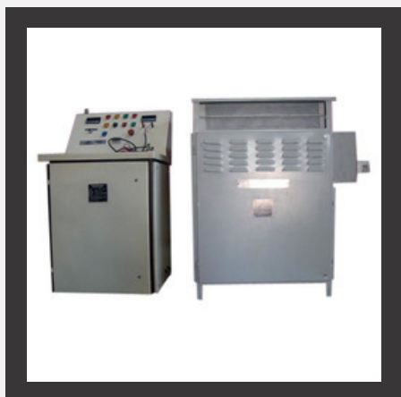
High Voltage DC and AC Breakdown Tester