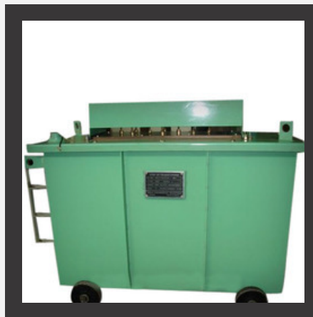
Auxiliary Testing Transformer