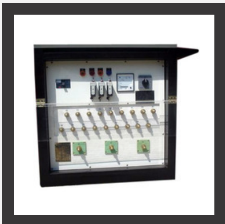
Three Phase Impedance Measurement Kit