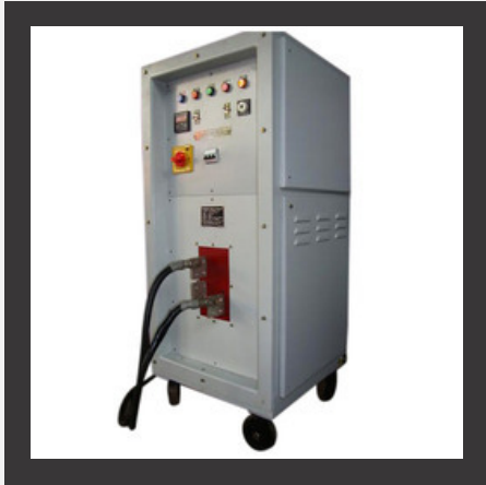
Resistance Brazing Machine