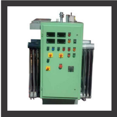
Auto Transformer Control Panel